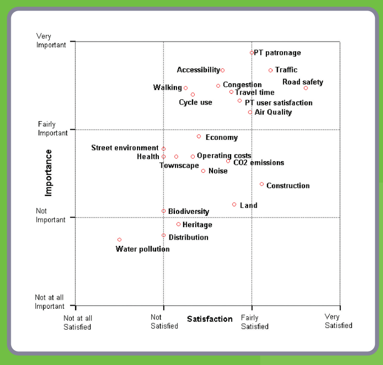
Figure 3: Importance and satisfaction with indicators (2004)

There is a tradition of monitoring transport patterns within the UK. There are therefore well established methods for collecting traffic speed, flow and accident data. In the past couple of decades air quality monitoring has become more important and other issues such as noise and local economic performance are now emerging. There is therefore pressure for an evolution of monitoring to keep pace with the changing understanding of the role of transport in supporting sustainable development. A snapshot of local authority views of the degree of importance and satisfaction with a range of transport indicators from the first DISTILLATE survey is shown in Figure 3.